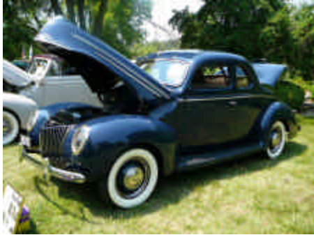
This is a highly detailed '39 - dual WW and a brown fan belt! Very high point car. Editor